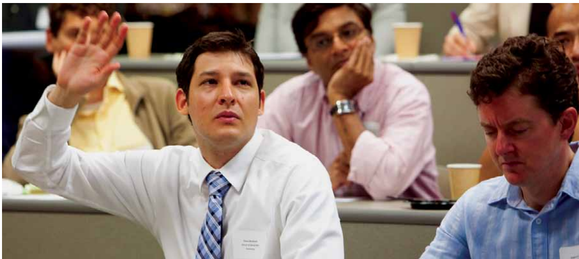
An orientation session brought together new faculty members from all Tulane University schools, colleges and campuses as the fall semester began.

and has visited at the University of Michigan Law School and Boston College Law School. She teaches federal income tax and tax policy generally. Her research, however, focuses on the intersection of the United States federal income tax and society, especially the historical, political, and social aspects. Most recently, for example, she presented a forthcoming book chapter, “Taxing Bachelors in America: 1895–1939,” at the University of Cambridge (UK) History of Tax Law Conference.