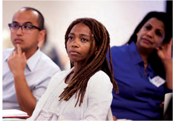
The Provost’s Office sponsors faculty development events throughout the year.