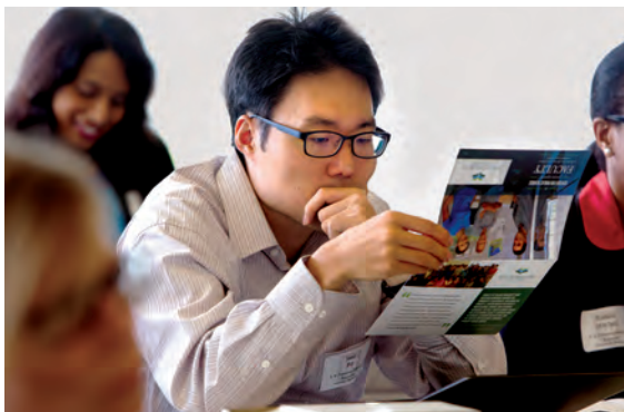
New faculty members learn about the Center for Public Service, established at Tulane in 2006.