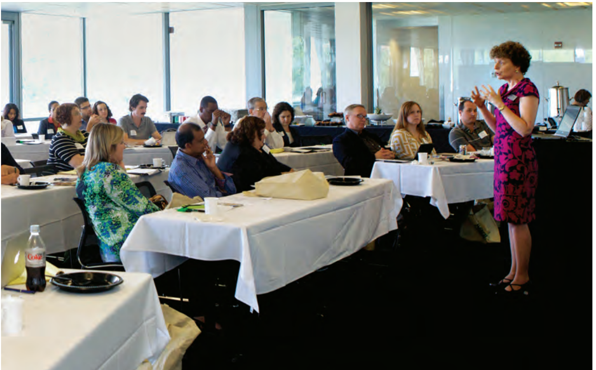
Tulane welcomes new faculty during orientation in August 2014.