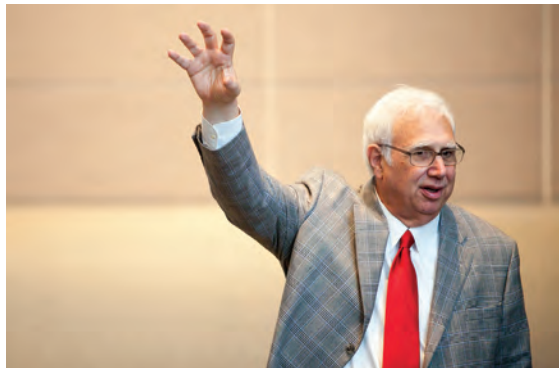
During the forum, the President Emeritus (above) discussed “Leading in Adversity.”

journals including the Journal of Accounting Research , Journal of Accounting and Economics , Contemporary Accounting Research and Review of Accounting Studies . He has previously served on faculties at the University of Illinois at Urbana–Champaign and the Yale School of Management. Prior to entering academia, he was an investment banker managing public offerings of large corporations. His research interests lie in the capital markets area of accounting, with particular emphasis on market efficiency and litigation risk.