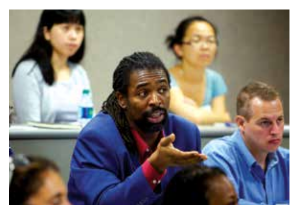
Faculty newcomers interact at Faculty Orientation.

2B Tribe Dance Theatre in New Orleans, performs as a solo artist, and choreographs commissioned works. Her areas of expertise are dance performance, dance education, and dance science.