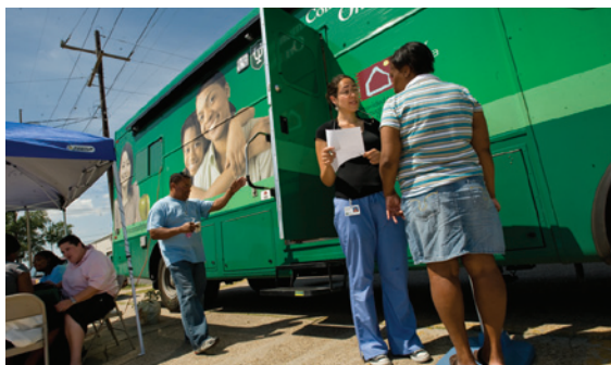
One of the Tulane community health mobile clinics works with patients in a New Orleans neighborhood.