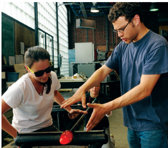
In the Newcomb Art Department's glass studio, a student learns the techniques of glassblowing.