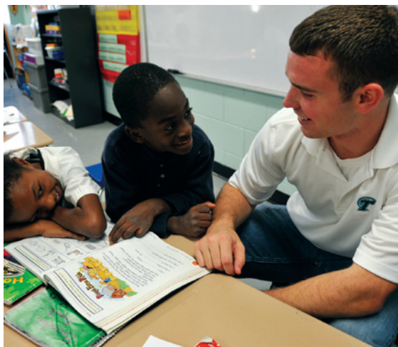
Helping New Orleans schoolchildren with reading is one of many service projects that involve Tulane students.